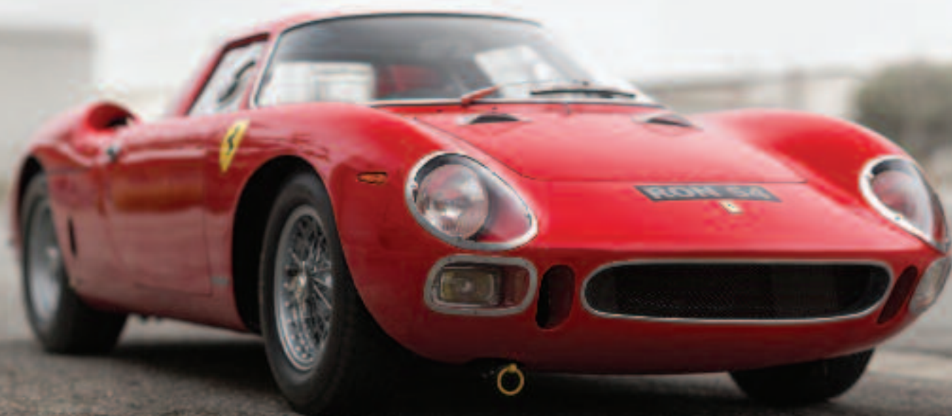
1964 FERRARI 250 LM Sold for $17,600,000 in Monterey

Around the world, RM Sotheby's is known for its incredible reach in the collector car market. Our in-house photography, design, marketing, and PR teams ensure that every consignment is presented to a prime audience in the best possible light and with the widest possible exposure. Whatever your automobile is worth, it will have the best chance of achieving an excellent result with RM Sotheby's.