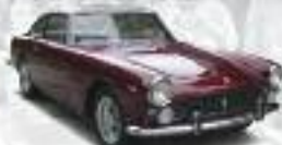
'64 FERRARI $505,000 330 AMERICA