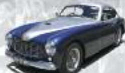
'49 FERRARI $1,050,500 166 INTER BERLINETTA