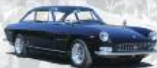
'66 FERRARI $404,250 330 GT 2+2