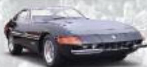
'72 FERRARI $731,500 365 GTB/4

NO RESERVE ENTRIES ARE ALWAYS ZERO ENTRY FEE AND 5% COMMISSION