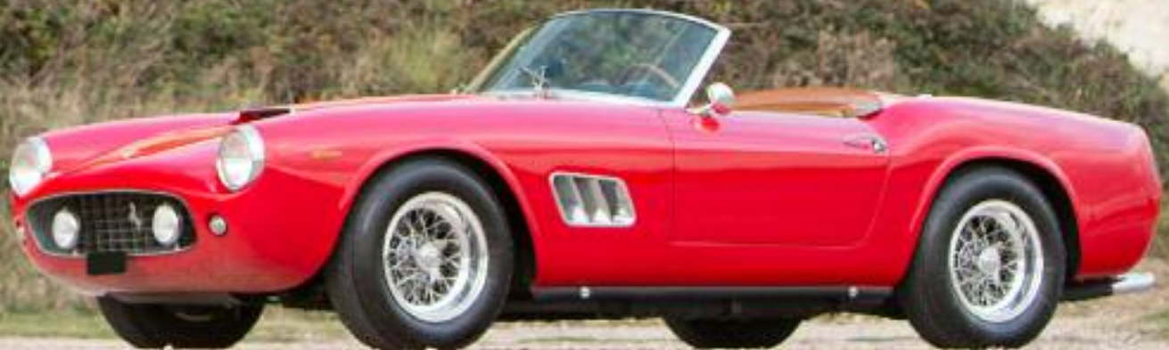
The Bruxelles Motor Show Matching numbers and documented history 1960 FERRARI 250 GT SWB CALIFORNIA SPIDER