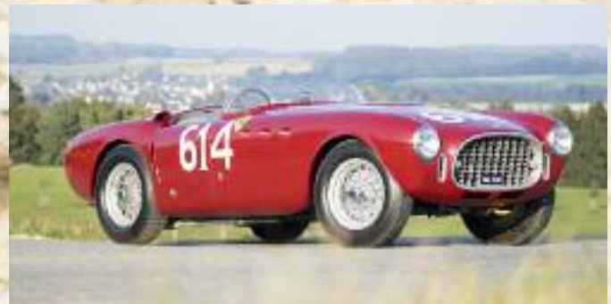
Ex Scuderia Ferrari Factory Le Mans, Mille Miglia and Targa Florio Entry 1952 FERRARI 340 AMERICA SPIDER COMPETIZIONE