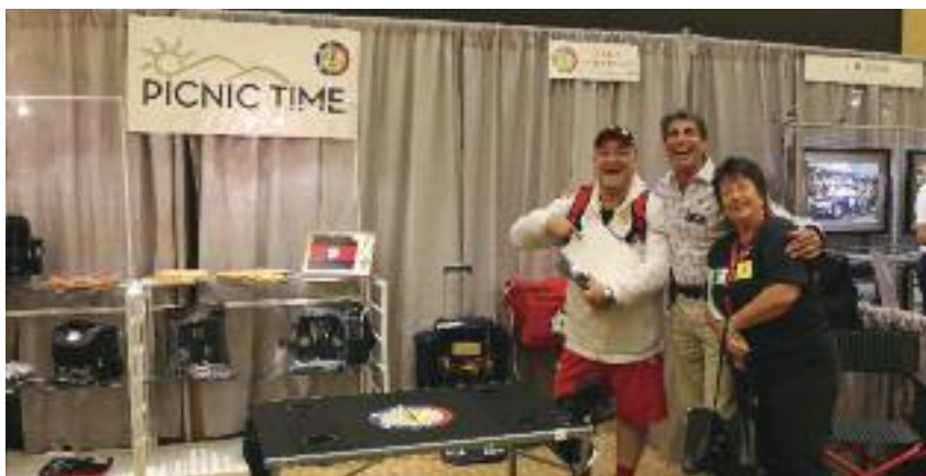
Photo captions from top: Mario's Service, Ferrari Factory. 2016 Concorso Ferrari Pasadena. 2016 FCA Annual Meet, Columbus, OH.