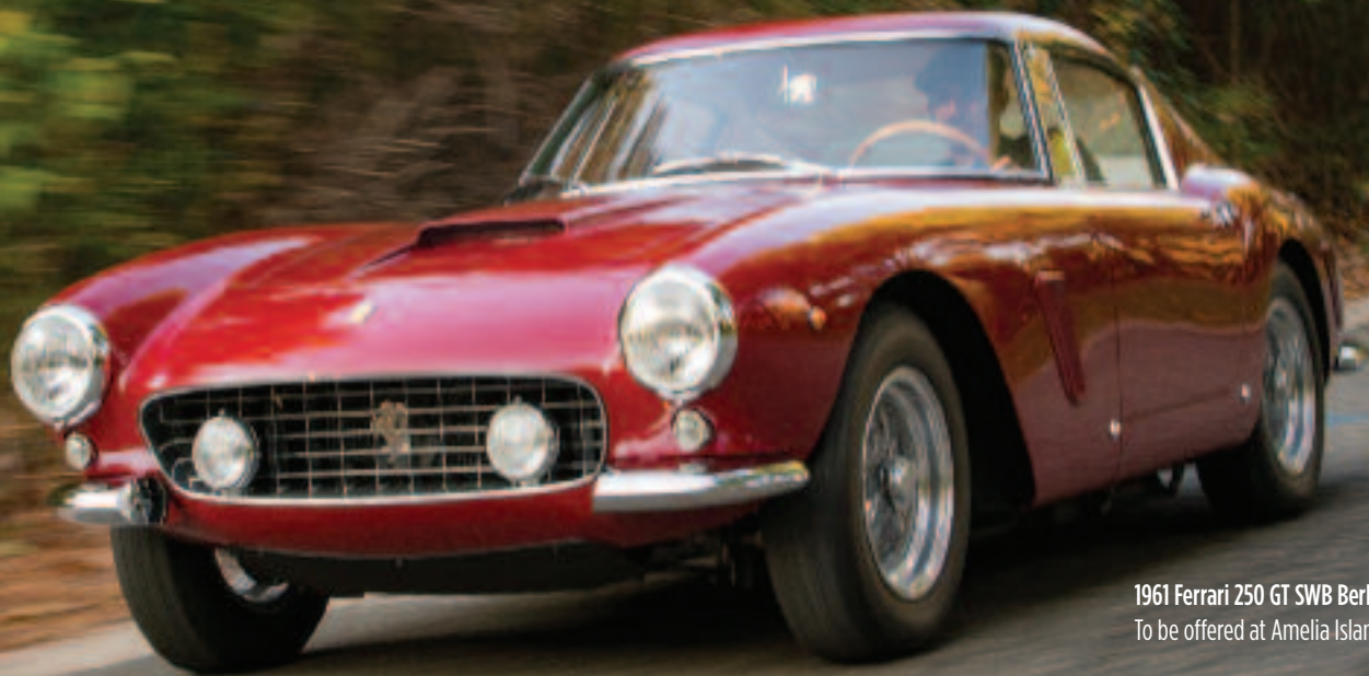
1961 Ferrari 250 GT SWB Berlinetta by Scaglietti To be offered at Amelia Island

AMELIA ISLAND • 11 MARCH 2017 MONTEREY • 18-19 AUGUST 2017