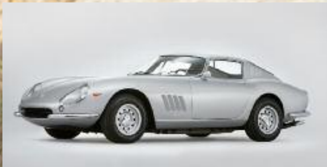
Long Nose - Torque Tube Ferrari Classiche Certified 1966 FERRARI 275 GTB Offered Without Reserve

January 17-18, 9am-6pm January 19, 9am-11am