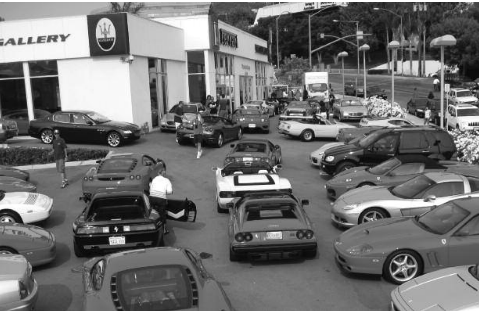
F430 Spider arrives at Auto Gallery. Auto Gallery's showroom parking area filled with awaiting Ride & Drivers.

Our thanks ro The Auto Gallery who catered our participant's breakfasts and provided a great starting point for our annual Monterey Ride & Drive.