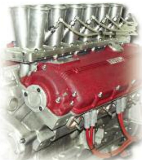
Ferrari Prototype Race Engine 450 Hp @ 7700 RPM 370 lb-ft @ 5800 RPM

Ferraris are the finest production road cars in the world. But when the finest is not good enough, CAROBU Engineering LLC provides the ultimate modifications for your prancing horse. Whether you are rebuilding your engine or tuning your car for the track or high performance street driving, accessories from Tubi-Style, Koni, Brembo and Razzo Rosso will add the final touch on your project.