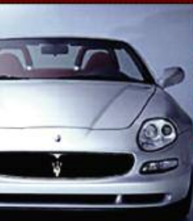
MASERATI of NEWPORT BEACH