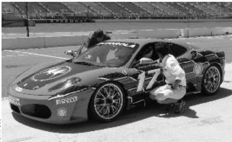
Tex K. Otto

1990 Testarossa: S/N 83568, Red/Tan, 19,707mi, Excellent cond., new brakes/ calipers, "Wheel Concept" 17" wheels with New Michelin Pilot Sports tires, custom exhaust with K&N air filter (35 hp. increase), Norwood glass engine bonnet, Momo Apache racing steering wheel, color matching front end bra and 15 disc CD changer/ Stereo. Seat belt upgrade done, new clutch and timing belts done at 14,000 mi., serviced at Beverly Hills Ferrari. Also includes original wheels/tires, exhaust, engine bonnet, and steering wheel. This car was featured in the Nov, 2003, Men's Journal issue as one of the sexiest cars in the world. $66,000. 310-770-5418, hilltopoctagon@earthlink.net (CA). 1/08