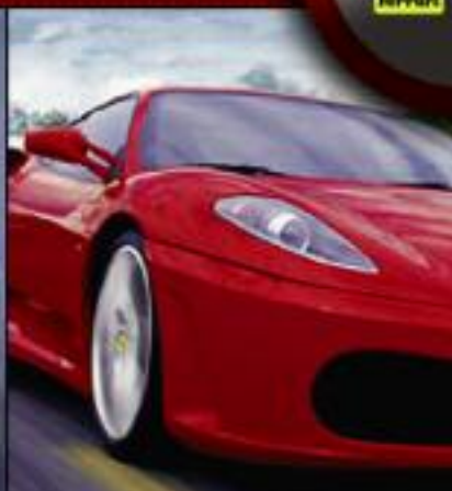
FERRARI of NEWPORT BEACH