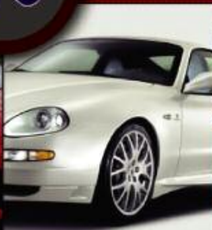
MASERATI of ORANGE COUNTY