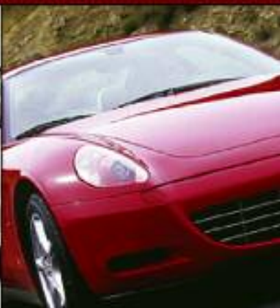
FERRARI & MASERATI of SAN DIEGO

Maserati of Newport Beach 1000 W. Coast Highway Newport Beach, CA 92663