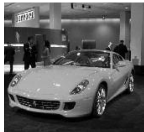
From opposite: One of two opposing 430 Scuderias which flanked the display entrance at the Los Angeles Auto Show. California Governor Arnold Schwarzenegger mingled with the auto manufacturers. F430 Spider. 430 Scuderia unique magnesium wheels. Maurizio Parlato during his press introduction. The Scuderia's stripped down interior is laden with carbon fiber. 599 GTB Fiorano.

Trac traction control system, offers 40% more acceleration out of corners than a traditional traction and stability control system. Track tests report that this new mid-engine berlinetta accelerates from 0 to 62 mph in just 3.6 seconds, equal to an Enzo.