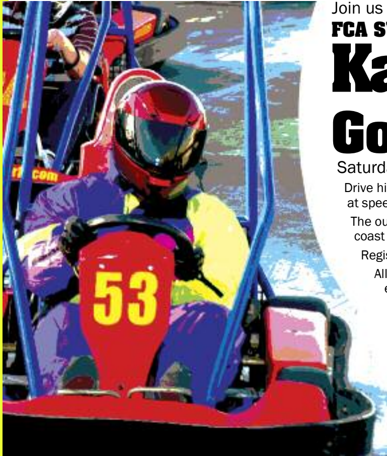
Register for event on page 36 or www.fca-sw.org

Join us for the exciting final competition of the FCA SW's Kart Grand Prix Series